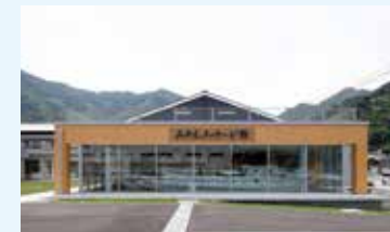
Mikan Message Museum (Osakishimajima)