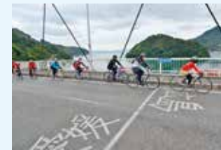
Okamura Bridge Prefectural boundary