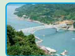
Toyohama Bridge (Bridge Length: 543m)