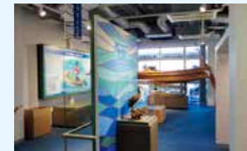
Red-Throated Divers Exhibition Room (Toyoshima)