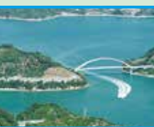
Okamura Bridge (Bridge length: 228m)