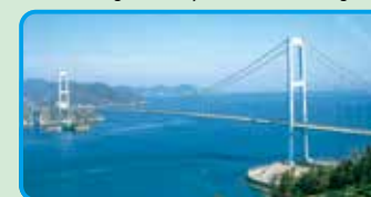
Akinada Bridge (Bridge length: 1,175m)

Strong wind may blow on each bridge. At the entrance and exit area, there are many slopes. Please watch out when you go through.