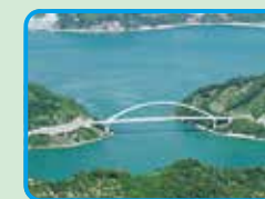
Nakanoseto Bridge (Bridge length: 251m)