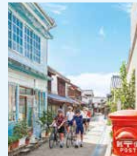
Mitarai townscape (Osakishimajima)