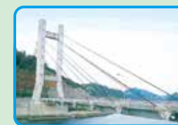
Heira Bridge (Bridge length: 98.5m)