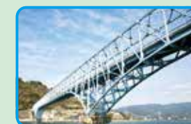
Kamagari Bridge (Bridge length: 480m)